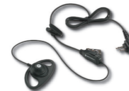
Earpiece with Inline Push-to-Talk Microphone Part # 56517