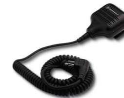
Remote Speaker Microphone Part # 53862