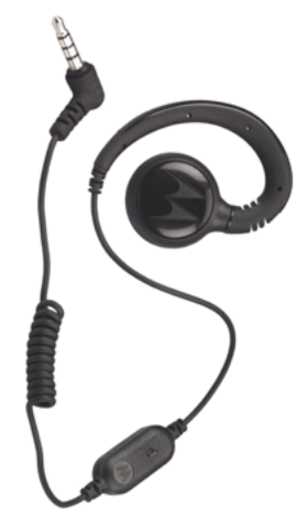
HKLN4513 - Swivel earpiece with in-line microphone