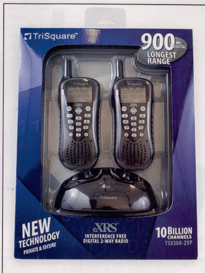
Photo C. The TSX300-2VP "Value Pack" in its retail packaging. It's a sign of the times when a complete and highly sophisticated FHSS voice/data radio communications system is sold on retail peg displays for less than $100. Until recently, two-way radios with similar advanced technology cost thousands of dollars and were generally available only to government and military users.

There's a lot to like in the TSX300 (see Figure 2 ), and its many features make it an exceptional price/performance value. It's clear that much thought went into the design of this