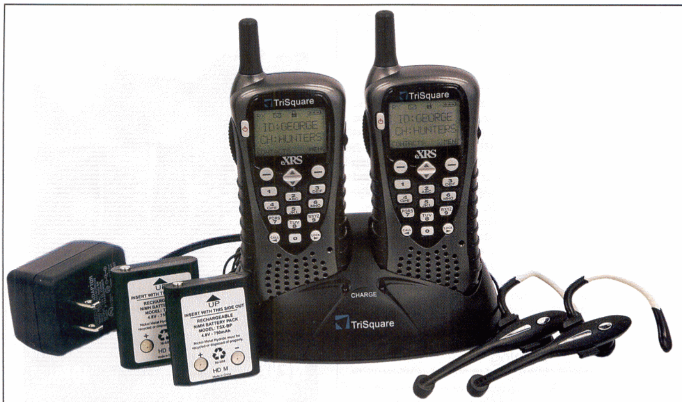
Photo B. The TSX300-2VP "Value Pack" includes two TSX300 two-way radios and a complete set of accessories: two VOX/PTT headsets, two NiMH battery packs, a dual desktop drop-in charger with AC adapter, and illustrated users manual. Radios and accessories are also available individually, so you don't have to buy unwanted replacements.

Frequency-Hopping Radio," December 2007, Pop'Comm ). As a result, the TSX300's audio reproduction sounds less synthetic and isn't severely distorted by non-speech background sounds. It's also near real-time audio, so there's no annoying delay caused by vocoder latency.