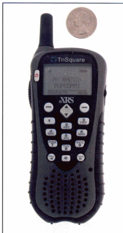
Photo A. The TSX300 eXRS (eXtreme Radio Service) Handheld Frequency-Hopping Spread-Spectrum (FHSS) Transceiver. Never before has so much sophisticated radio communications technology with so many advanced features been available in a two-way radio priced for consumers.

Was a practical solution buried in these obscure FCC regulations? Since FHSS can effectively create a nearly unlimited number of "virtual" radio channels (by using many different hopping sequences)