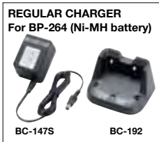
REGULAR CHARGER For BP-264 (Ni-MH battery)

* Tx: Rx: standby = 5:5:90. Power save function ON.