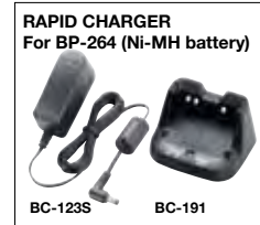
RAPID CHARGER For BP-264 (Ni-MH battery)

*1 BC-123SA/BC-147SA for 120V AC. SE for 230V AC. SV for 240V AC.