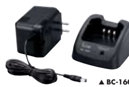
▲ BC-145 ▲ BC-160

BC-160 DESKTOP CHARGER + BC-145 AC ADAPTER Charges the BP-231 in 2 hours (approx.). BC-119N + AD-106 + BC-145 is also available. : Charges the BP-231 in 2 hours (approx.).