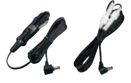
▲ CP-17L ▲ OPC-515L

CP-17L CIGARETTE LIGHTER CABLE, OPC-515L DC POWER CABLE For use with the BC-160 or BC-119N. (12–16V DC required).