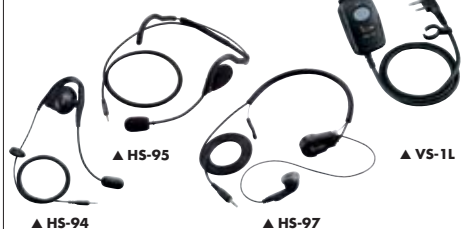
▲ HS-94 ▲ HS-95 ▲ HS-97 ▲ VS-1L

HS-94 : Earhook headset with flexible boom microphone. HS-95 : Behind-the-head headset with flexible boom microphone. HS-97 : Throat microphone fits around your neck and picks up speech vibration. VS-1L : PTT/VOX unit. Required when using these headsets with the transceiver.