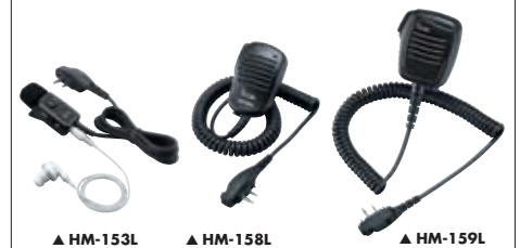
▲ HM-153L ▲ HM-158L ▲ HM-159L

HM-153L : Durable earphone-microphone with revolving clip. HM-158L : Compact and durable body with screw-type connector. HM-159L : Full size durable speaker microphone.