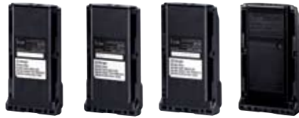
▲ BP-230 ▲ BP-231 ▲ BP-232 ▲ BP-240